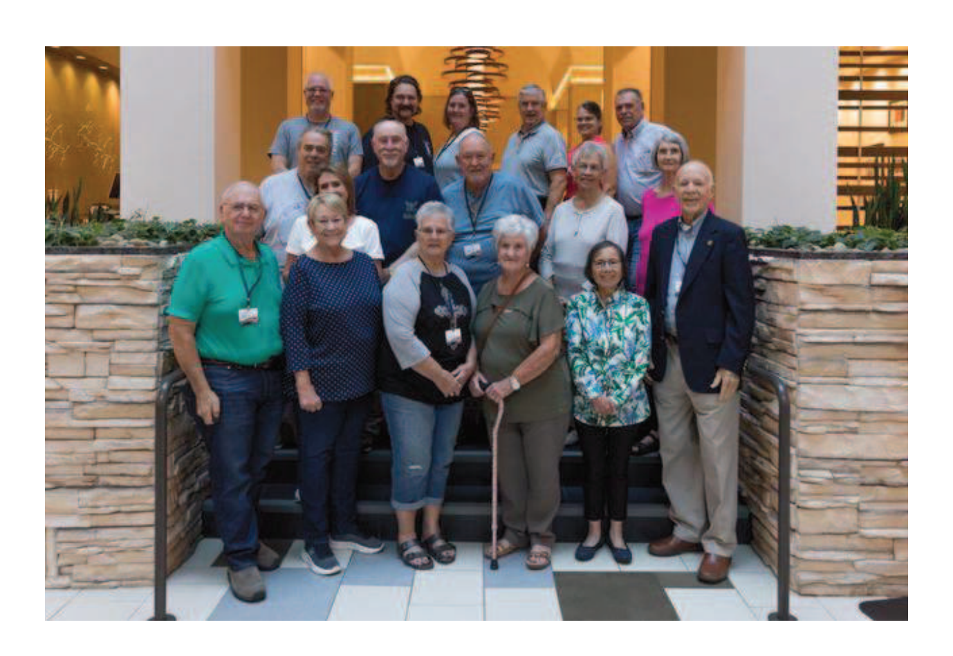
September 24-28, 2023

Recap of 2023 USS Savage Reunion Baton Rouge, LA and our 2024 Reunion in Rapid City, SD!